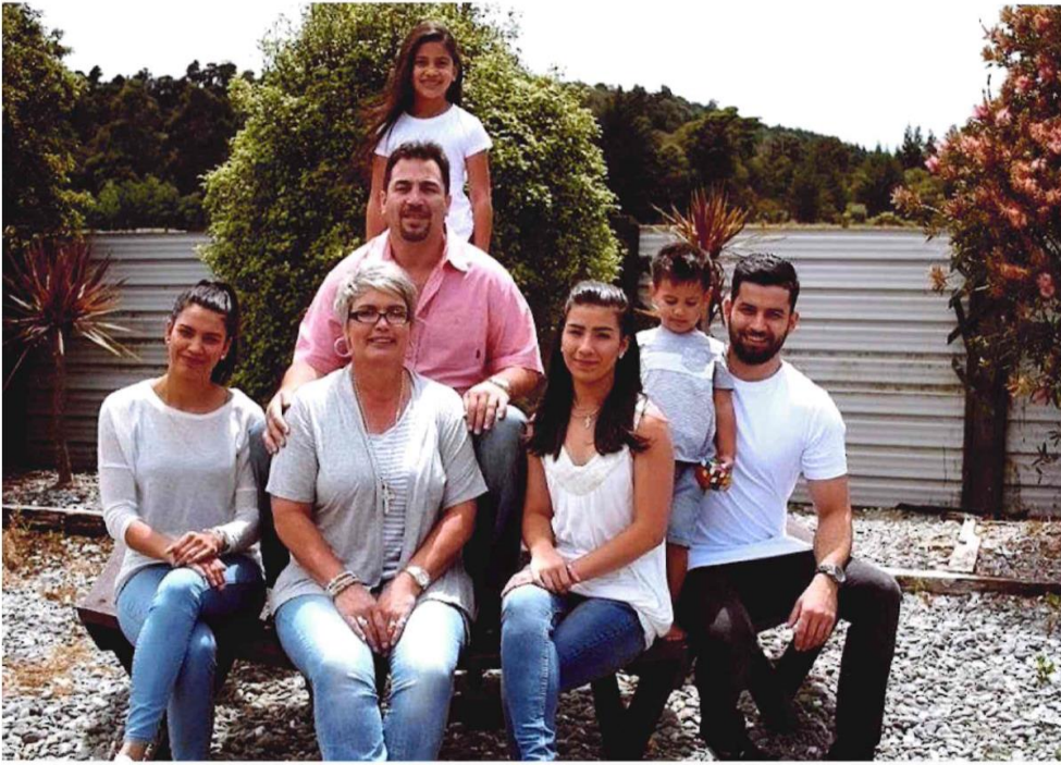
MEET THE LAWRENCE FAMILY